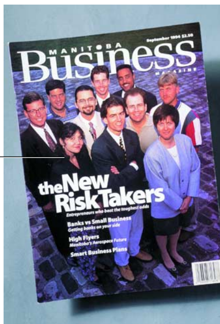
Feature article on up and coming young entrepreneurs.

RESPONSIBLE FOR instructing various levels of two, four and six week 'hands on' home decorating classes out of the office of Design Associates. Classes taught in a friendly and interactive environment. Students learn concept development, basic design principles, problem solving, colour theory (including the creation of a material/image board). Classes are practical and visually oriented with interactive material.